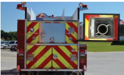
Low suction hose possibilities