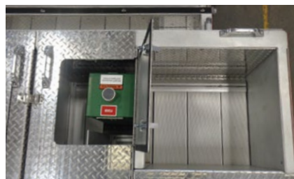
Foam System and Foam Cell up to 50 gallons