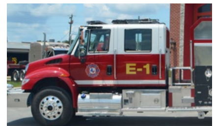
Under cab compartments