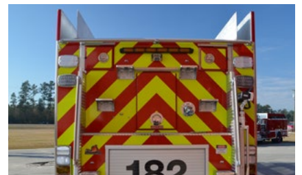
Extra wide 95" hosebed