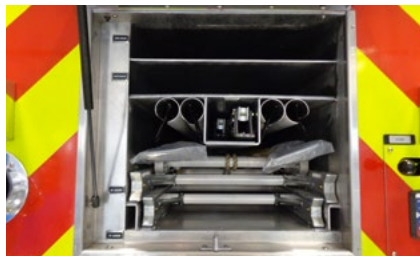
Enclosed through-the-tank storage