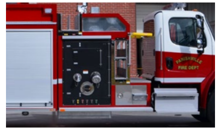
Variety of crosslay, speedlay and walkway crosslays available