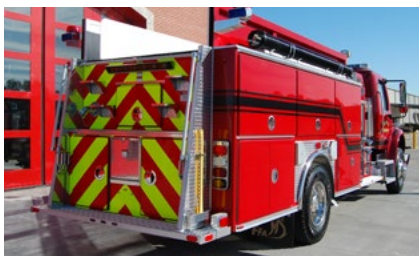
Extended 8" rear compartment