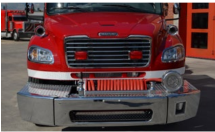
Customized front bumper options